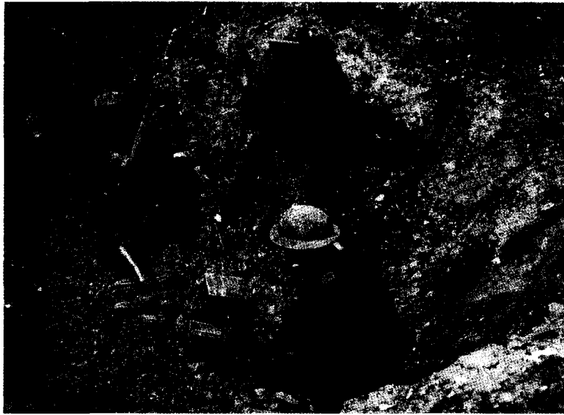
British troops using a French ground-telegraphy system, which did not rely on wires that could be cut by shell fire

inevitable lack of speedy reaction to the situation at the front, the shattering of the telephone lines between observers and the guns, had been almost wholly responsible for the frustrations and delays 5 . The Germans succeeded in reforming their trench line just a thousand yards or so further back.