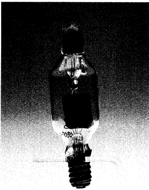
One of the original 'Audion' tubes developed by Lee de Forest

Before the war, electron tubes were manufactured by hand in small numbers. Just after the war H. J. Round wrote: 'I have mentioned that the production of valves at that time [early in the war] required special men. ... it was a terrible process. Again and again we lost the knack of making good tubes owing to some slight change in the materials used in their manufacture.' 16 Yet wartime communication needs called for hundreds of thousands of tubes, and it was not simply a matter of increasing the number made. The tubes had to give consistent performance to predetermined standards, and they had to be long lived. There needed to be physical standardisation—exterior dimensions, base, and socket—and performance standardisation, insuring uniform characteristics in large numbers of tubes so that tubes would be interchangeable. To achieve this standardisation there had to be test equipment and agreed-upon test procedures.