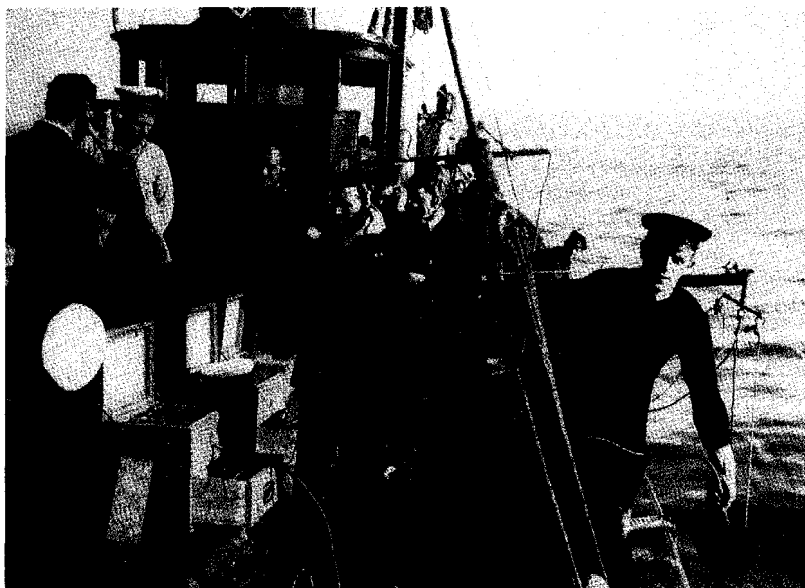
Hydrophones in use at Otranto in 1917. In the right foreground a sailor is holding a nondirectional hydrophone. In the right background are two directional hydrophones suspended from a boom. On deck are boxes containing batteries and transformers.

There were some other applications of electron tubes during the war. There were a few electronic control-devices: in airplanes some generators incorporated a vacuum-tube automatic compensator that helped