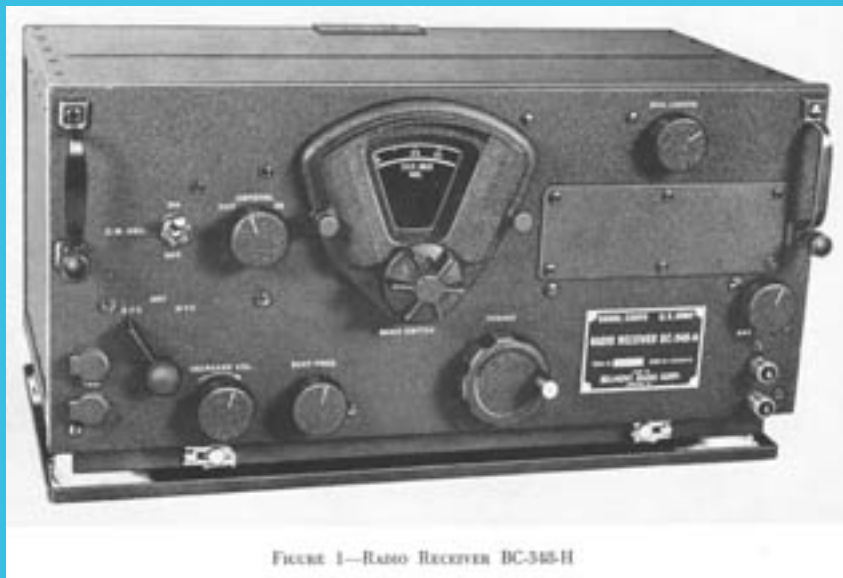
FIGURE 1—Radio Receiver BC-348-H

vintage of receiver I deal with. One model of it is populated with metal tubes with grid caps. A real blast from the past. As best I can tell, the design of these receivers dates from the mid-30's. They are a completely classic single-conversion superhetrodyne design. No frills, nothing too fancy. Good, solid, and reliable. Inside, a great deal of the metalwork is either stainless or alluminum, so these receivers rarely show any significant corrosion. Since they are typically 60 or more years old, they are often full of various kinds of insect nests and dust, but nothing more serious than that. Unfortunately, it is rare to find one of these receivers that has not been modified. In fixing up these receivers, I spend much too much time backing out half-baked mods that some yo-yo wired in decades ago.